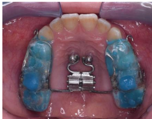
Figure 2. Hybrid Hyrax expander, anchored on 2 paramedian palatal mini-implants.