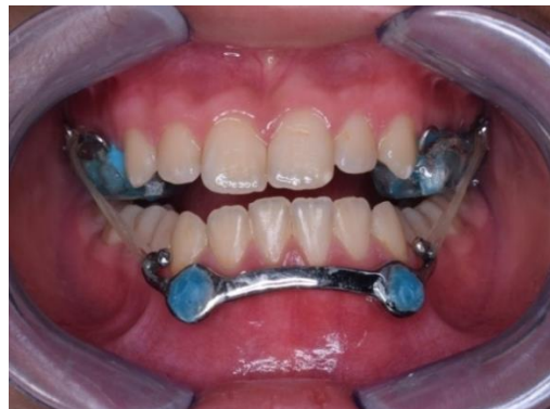
Figure 3. Miniscrew anchored maxillary protraction, intermaxillary elastics running from hybrid hyrax to the miniscrew supported mandibular bar.